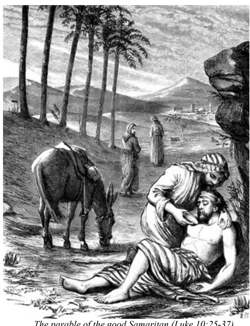
The parable of the good Samaritan (Luke 10:25-37)

Oiktirmos is used together with splagchna in Col. 3:12 and others. It means "bowels in which compassion resides, a heart of compassion, manifestations of pity, longing."2